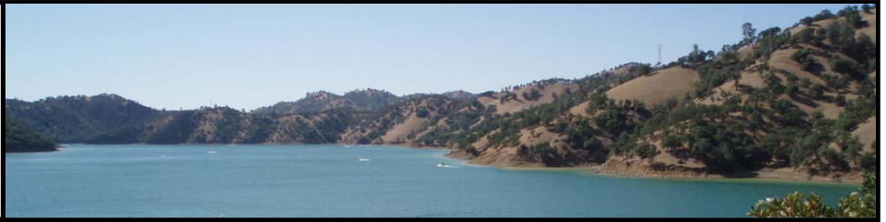
SCWA Image Image